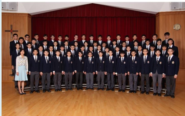
Smart-looking SPC students in their winter uniforms